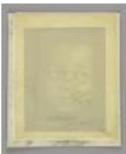
Twelve Million Black Voices