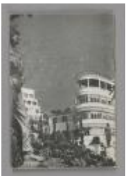
Public Health in the U.S.S.R