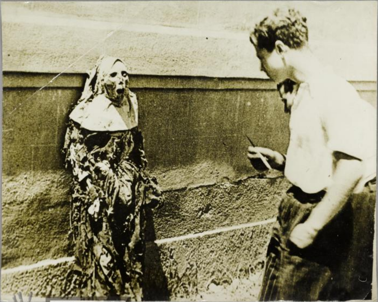
AKADEMIE DER KÜNSTE