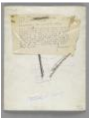
The Making of Steel